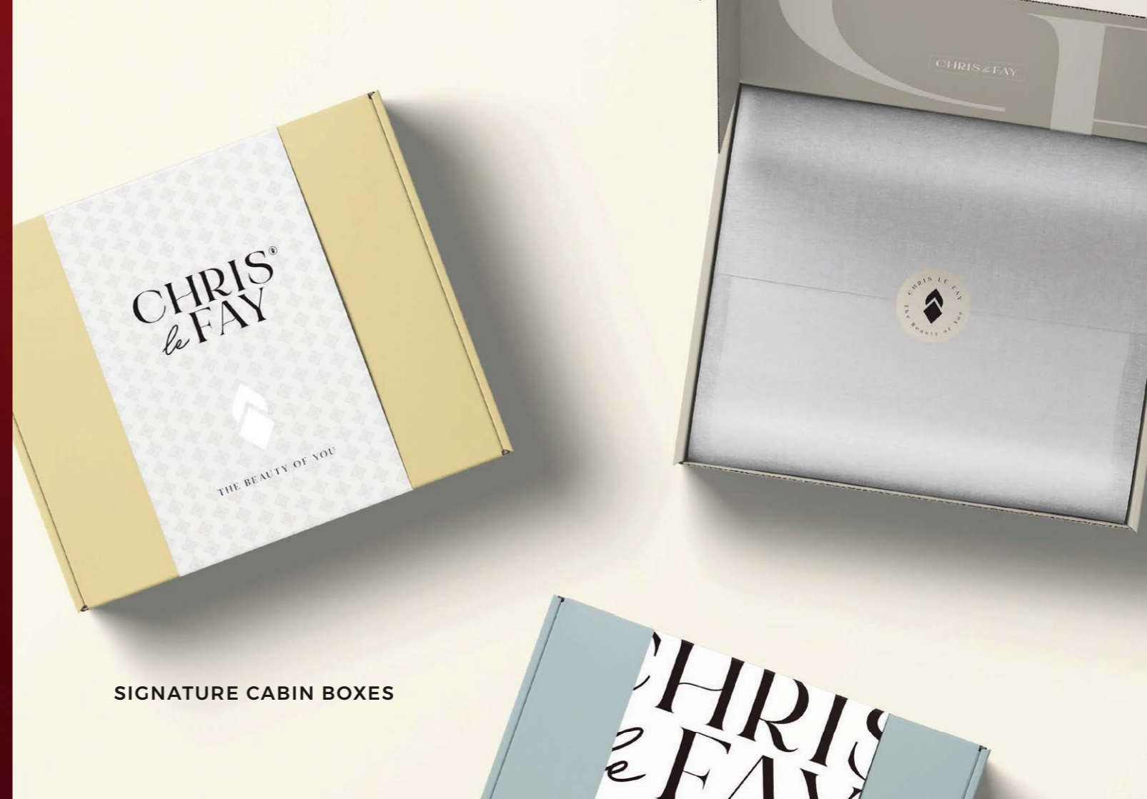
SIGNATURE CABIN BOXES